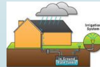
rain water harvesting