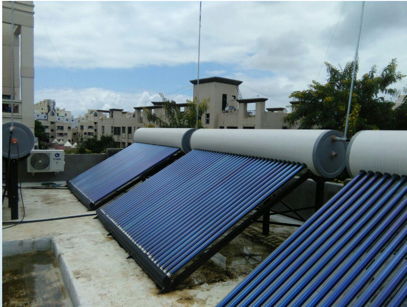
Tarachand hospital Pune