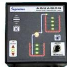
water level controller